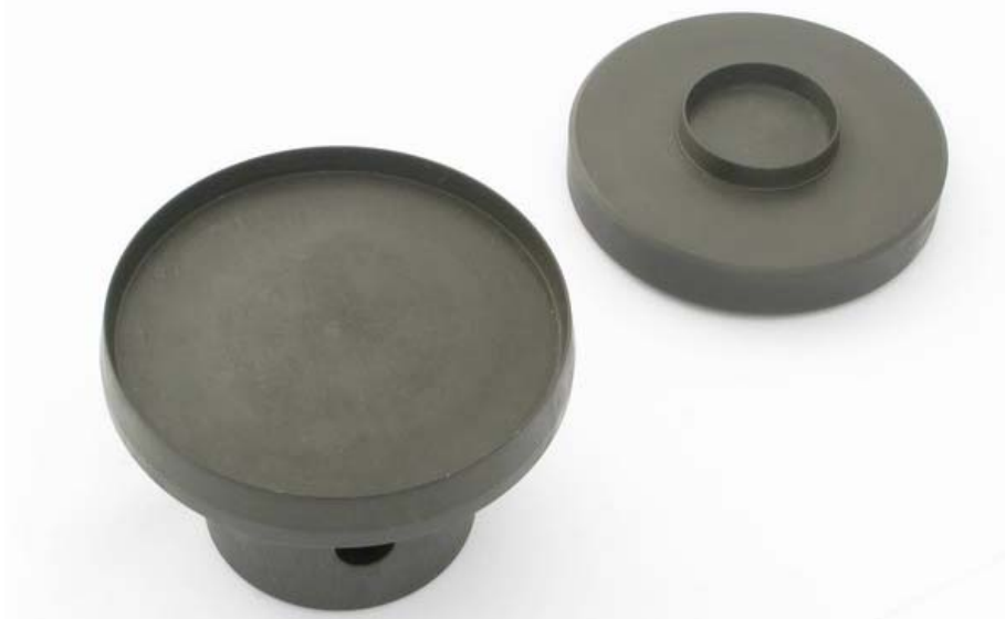
GC1499 Ring on Ring Fixture

G747-C1499 is designed to be used with a universal compression testing machine to determine the flexural strength of advanced ceramics, as specified by ASTM C1499.